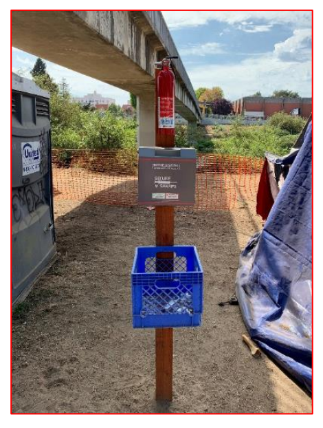
One of several collection boxes placed into the community.