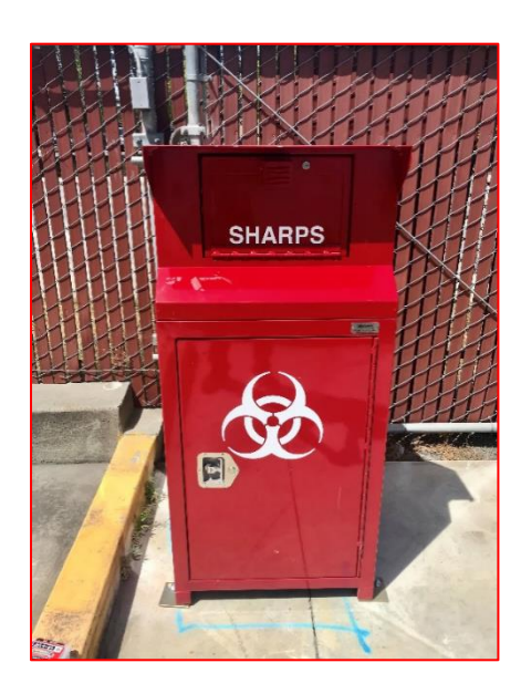
A larger "kiosk' box for public use.